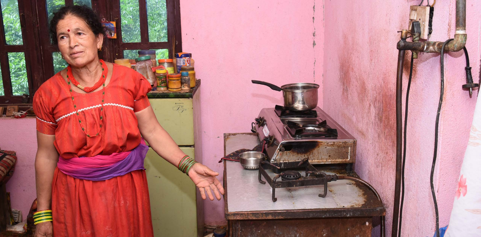
Image 6. A Nepalese woman with her biogas cookstove.