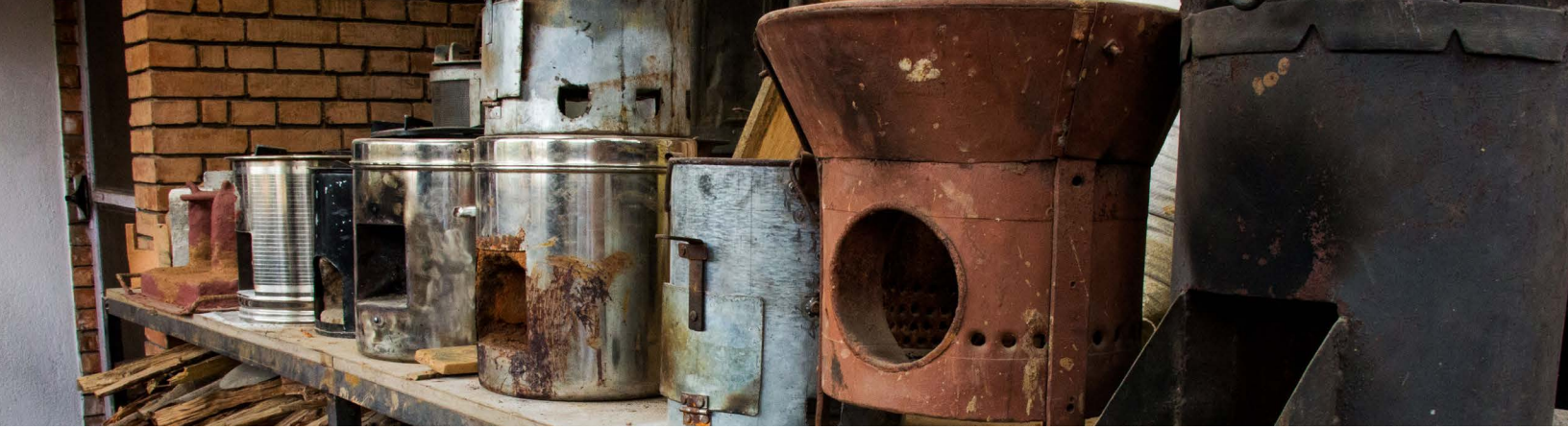
Image 3. A variety of metallic biomass cookstoves on display in Nepal.