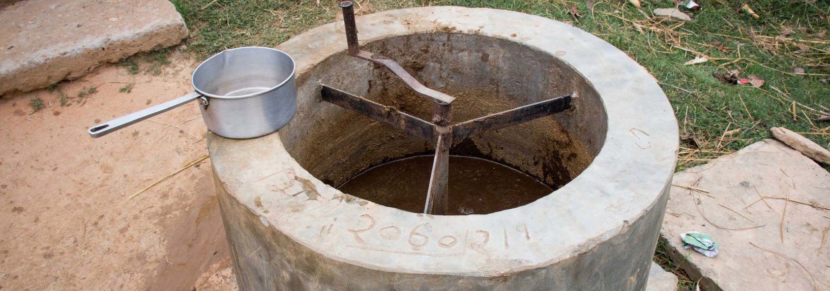
Image 4. A biogas system in Nepal.