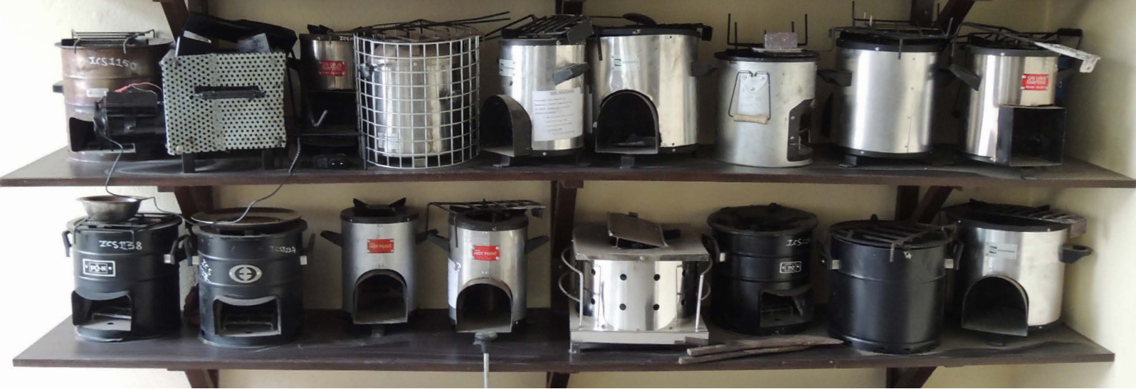
Image 5. A variety of biomass cookstoves on display in Nepal.

employment and productivity, reduce dependency on traditional energy, and sustainably integrate alternative energy into socioeconomic activities in rural areas. NRREP also had a strong poverty-reduction focus. Cooking was one component of this broader energy intervention (Government of Nepal, 2012).