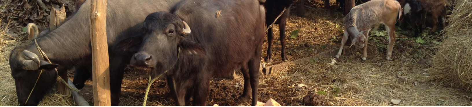
Image 2. Biogas systems, like those in Nepal, require waste from cattle to produce energy.