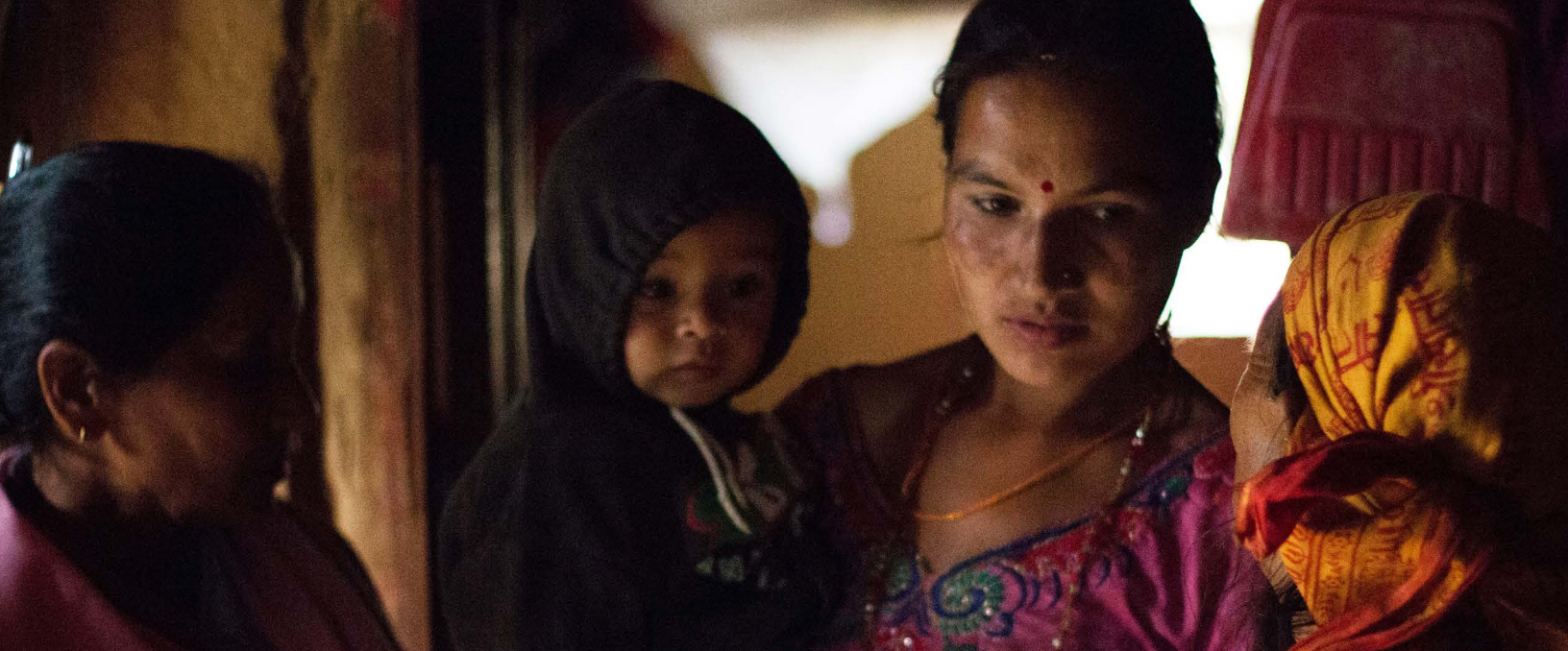
Image 7. A Nepalese family.