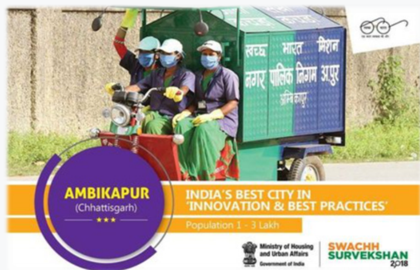
A Waste Recovery Tricycle Ministry of Housing and Urban Affairs, Government of India

The program incorporated educational and inclusion activities, such as street plays and informational murals and posters, to engage the entire community. The initial SLRM strategy proved successful, and it expanded from the initial 17 wards to all 48 of the city's wards. As of 2020, the program successfully employed and empowered 447 women. It also resulted in 100% cost recovery in waste management, with the user fees, sale of recyclables, and a consolidated tax paying for the entire program. Overall, the program successfully reduced the amount of waste dumped throughout the city, and, as one of the most visible signs of the program's success, the city's dumping ground was converted into a popular municipal park.